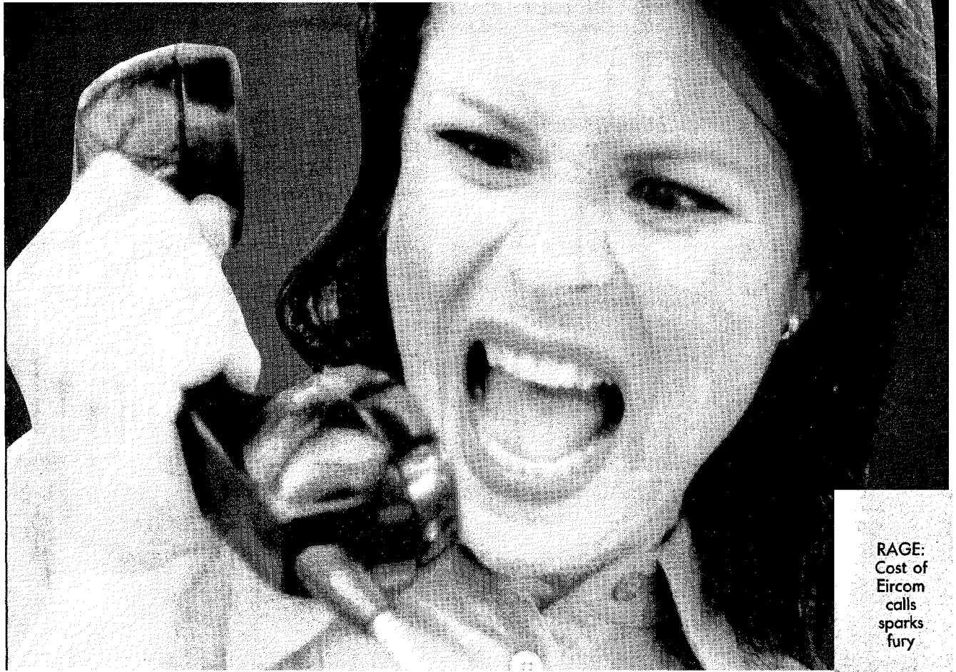
RAGE: Cost of Eircom calls sparks fury